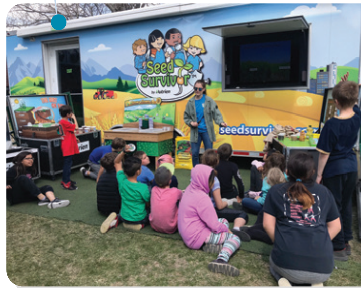
Journey 2050 and Seed Survivor are sponsored by Nutrien.